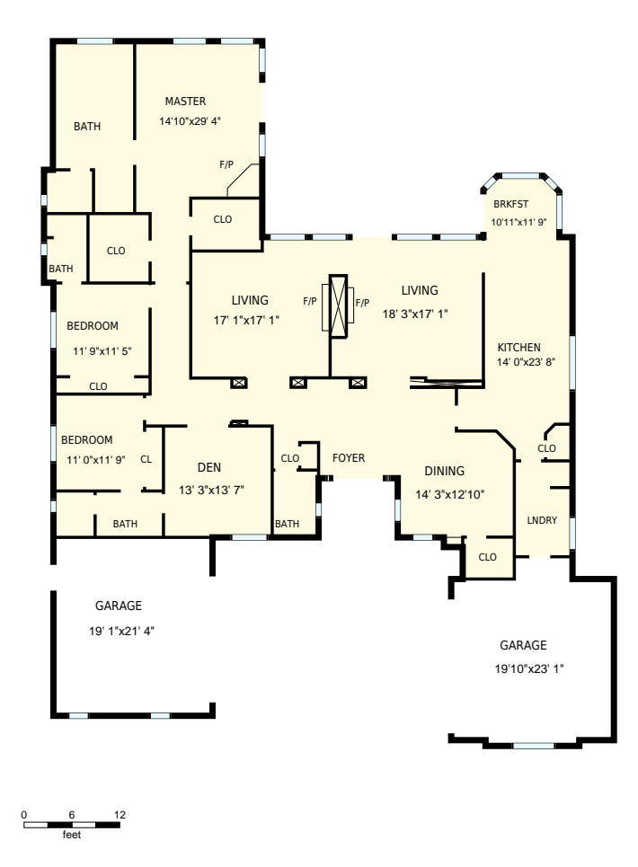
Main floor Exterior Area 3258 sq. ft.

Total Exterior Area Above Grade 3258 sq. ft.